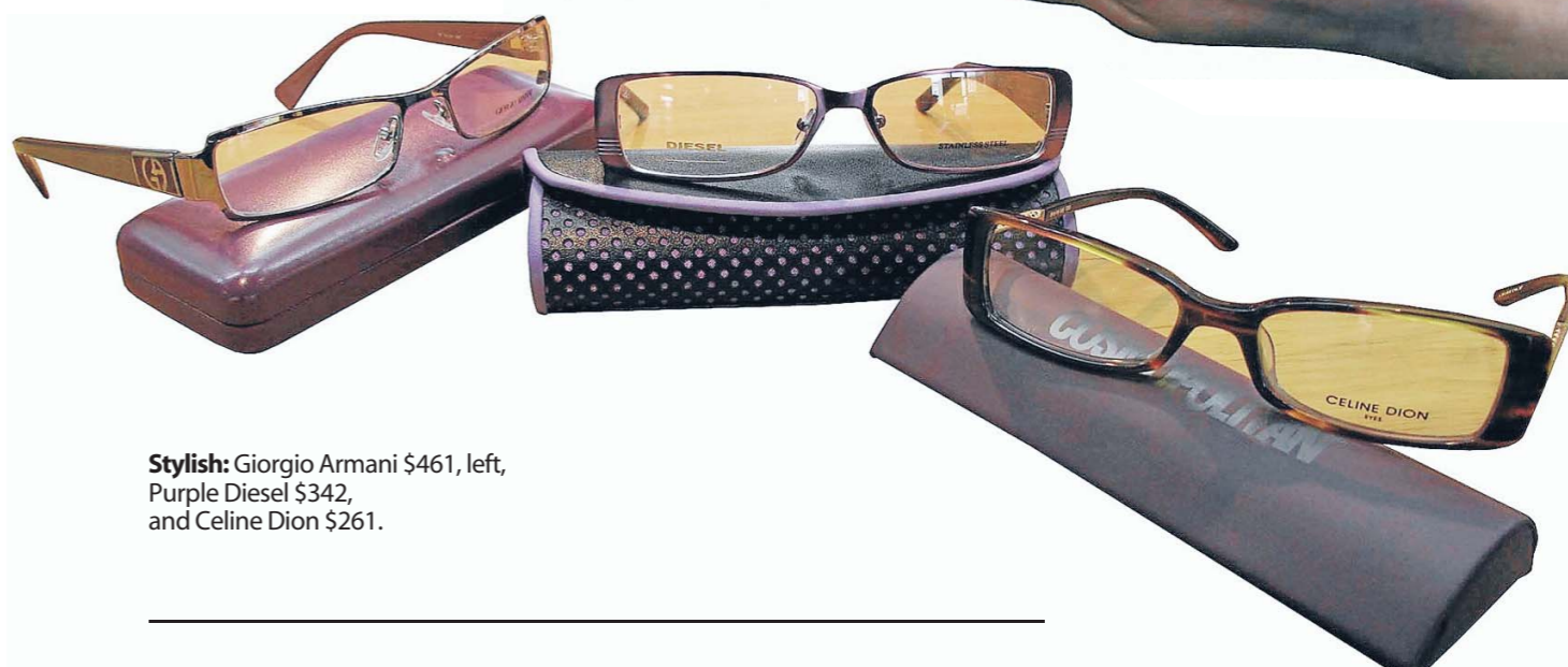
Stylish: Giorgio Armani $461, left, Purple Diesel $342, and Celine Dion $261.

Flexon: And for those who are just too strong for their own good. The new Nike, Flexon has been introduced on to the market as having INCREDIBLE TECHNOLOGY. Bend them and you will not break them - $393.