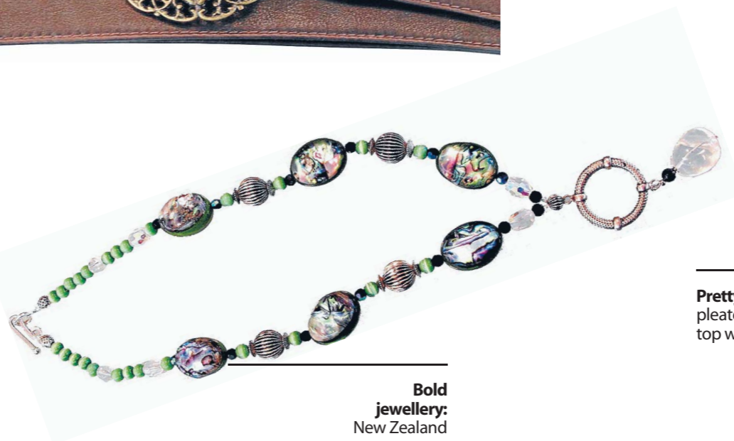
Bold jewellery: New Zealand paua.