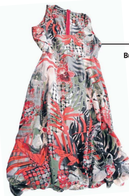
Bubble skirt: Light-weight, silk/cotton, floral print, dress up or down, looks good with boots or can look fantastic with tights underneath.