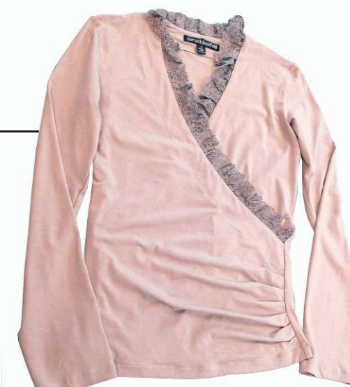
Pretty in pink: Fitted pleated crossover top with lace trim.