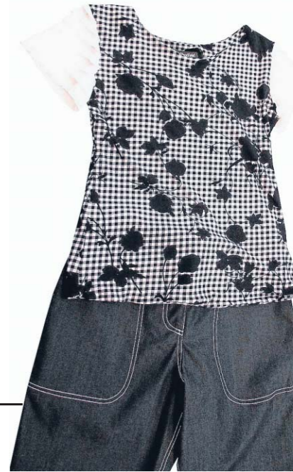
Black and white together: Short frilly sleeved, perfect with contrasting stitched jeans.