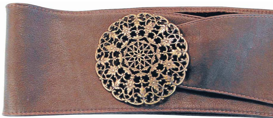
Belted: Wide belt, big buckle, cool hip-fitting belt.