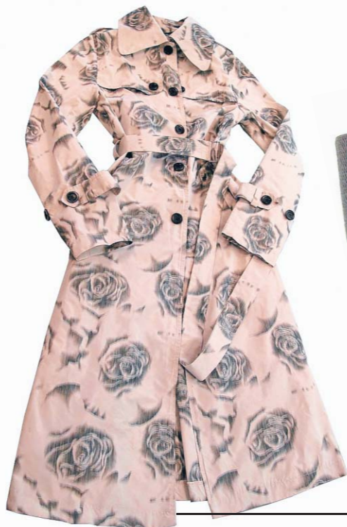
Summer trench: Single-breasted, static floral, memory fabric, holds its shape. Lightweight. Perfect for protecting you from the wind on a summer's day. Can be worn with anything.

Warwick gives us a sneak peek at his soon-to-be released spring/summer collection.