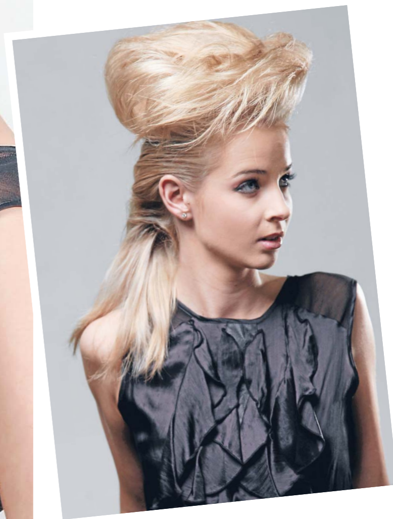
Get the look: Styling irons are a popular way of achieving a fresh look. They are easy to use at home, but make sure you use products to protect the hair.

Hair-care products for when using styling irons, from the Schwarzkopf Osis range: Sparkler – Gloss Shine Spray: Long-lasting product, will keep hair straight until the next day. Flatliner – Form Flattening Iron Serum: Provides heat protection for hair, when using a styling iron. Slick – Form Flattening Liquid: Hair remains straighter for longer. Keeps hair straight in rain and humid conditions. Magic – Gloss Anti-Frizz Serum: Finishing product. Instant shine with a smooth silky touch.